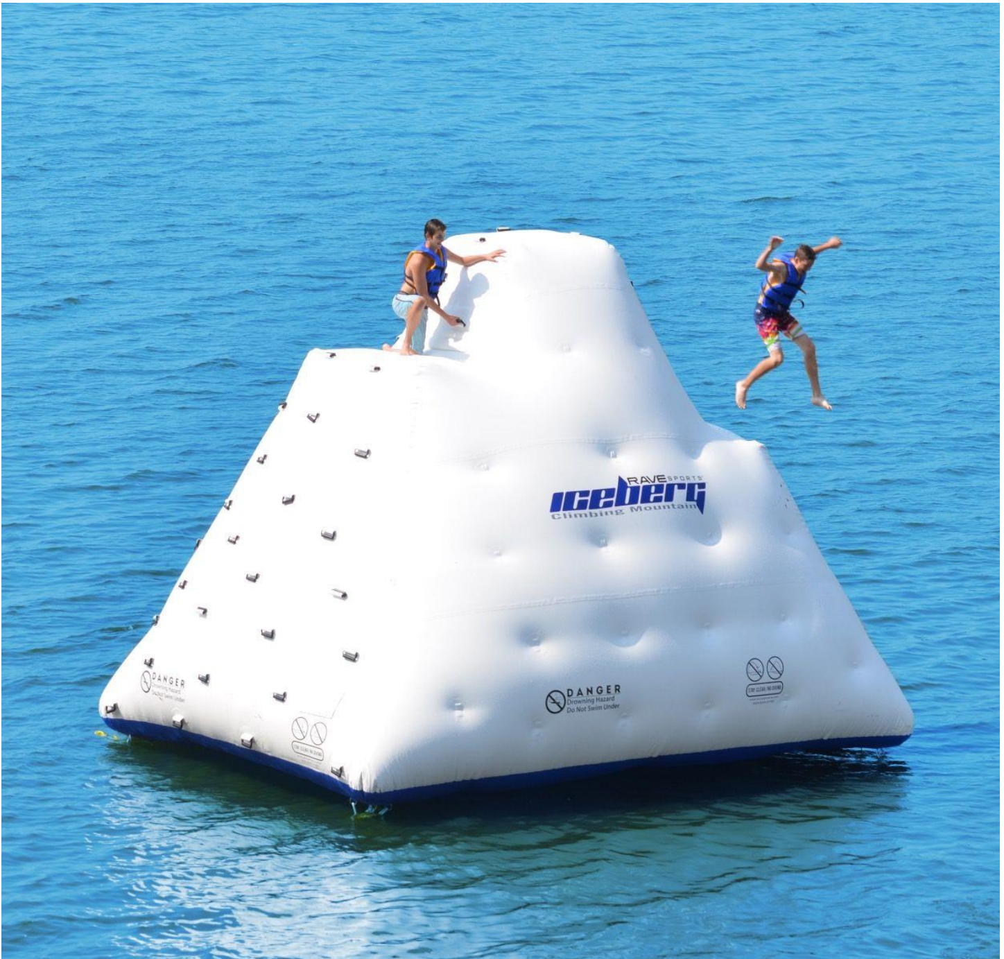
Approximate cost $11,000 to $12,000